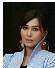
Indonesia Leather bag