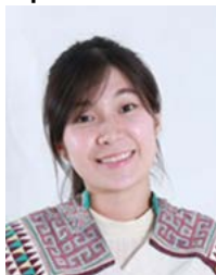
Lao PDR Handicraft