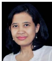
Indonesia Agritourism & Ecotourism