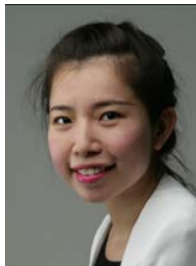
Vietnam Education & Trading