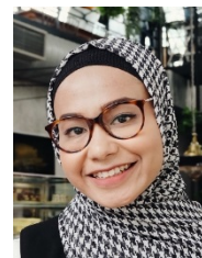
Indonesia Health promotion