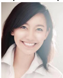
Japan Career counseling